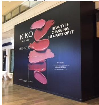
Full wrap graphic